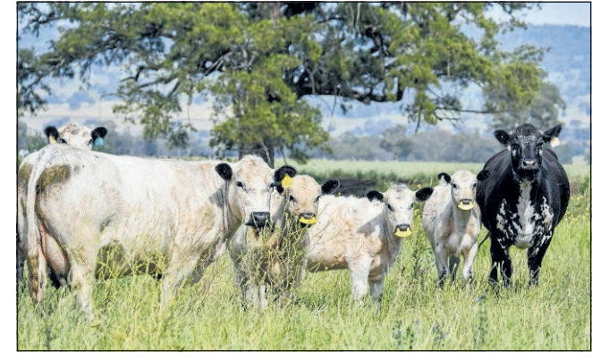
The Canadian company behind the nose flaps say calves wearing them will spend 25 per cent more time eating and pace less than traditional weaning.