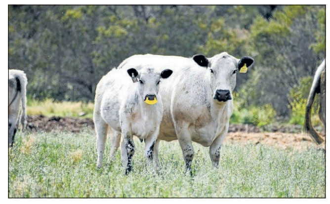
A cow and calf combination during the weaning process which was very silent throughout the paddock.